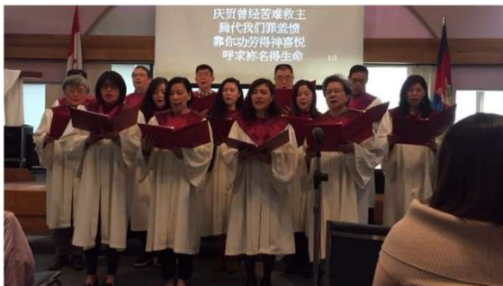
2018/04/29 RECBC 列治文圣道堂 诗班献诗 《快來崇拜受苦救主》