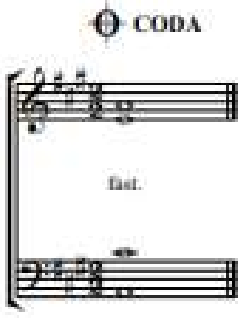
He Will Hold Me Fast (When I Fear My Faith Will Fail) (Hymnal: Key of A)